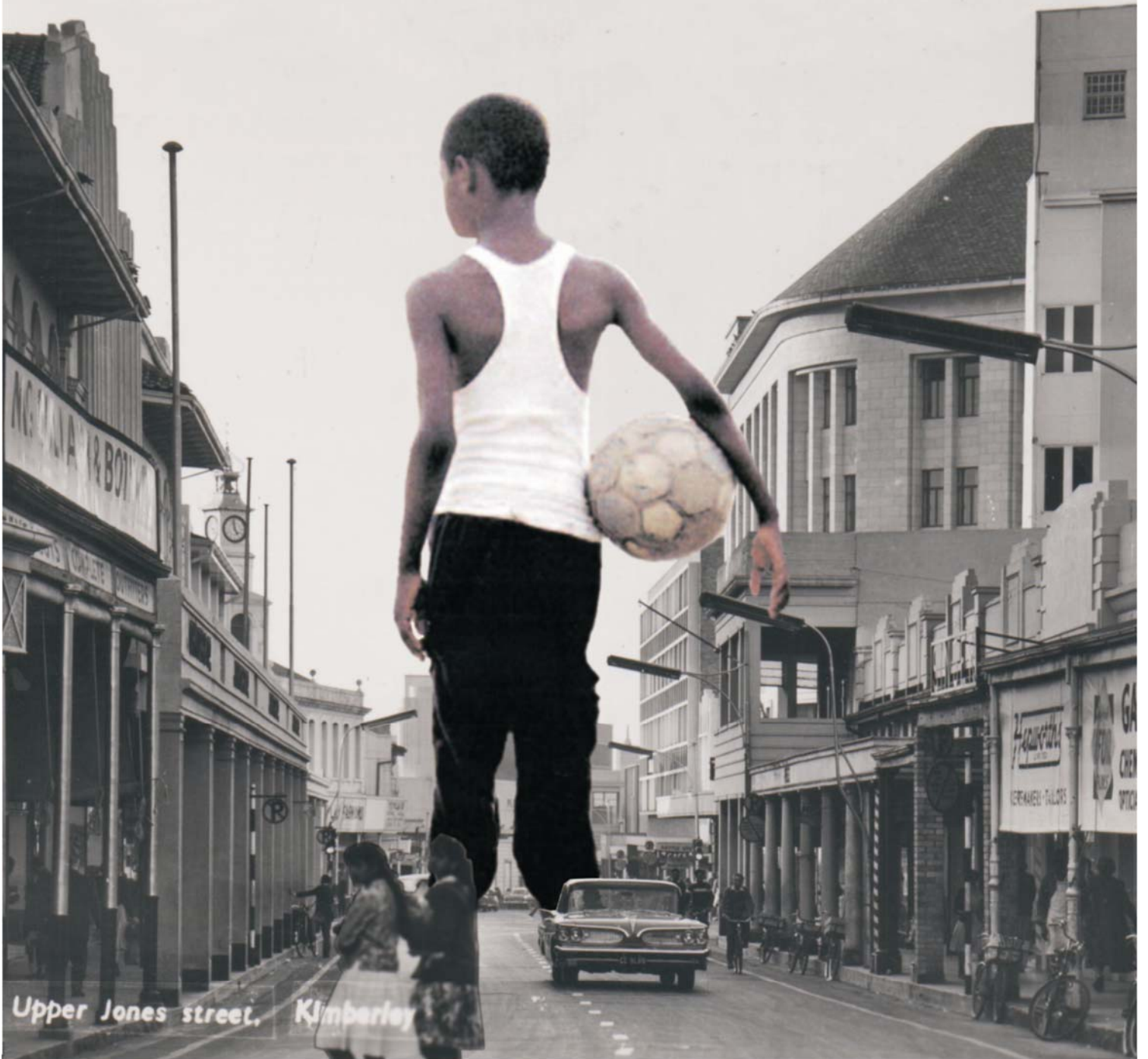
Upper Jones street, Kimberley